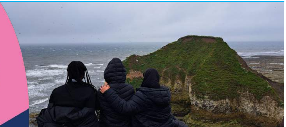
Y9 had a fab, although soggy day exploring Flamborough Head. As well as seeing landforms such as a cave and arch we were lucky to see puffins and seals.