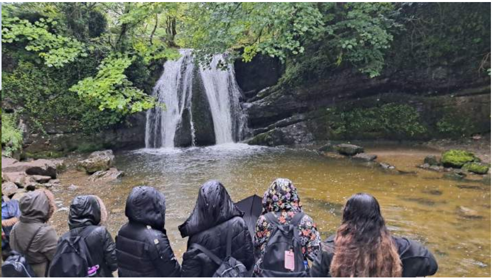
A fab but wet walk in the Dale's saw Y8 head to the waterfall Janet's Foss and also come across some local wildlife.