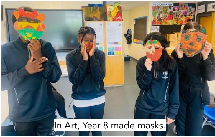
In Art, Year 8 made masks.